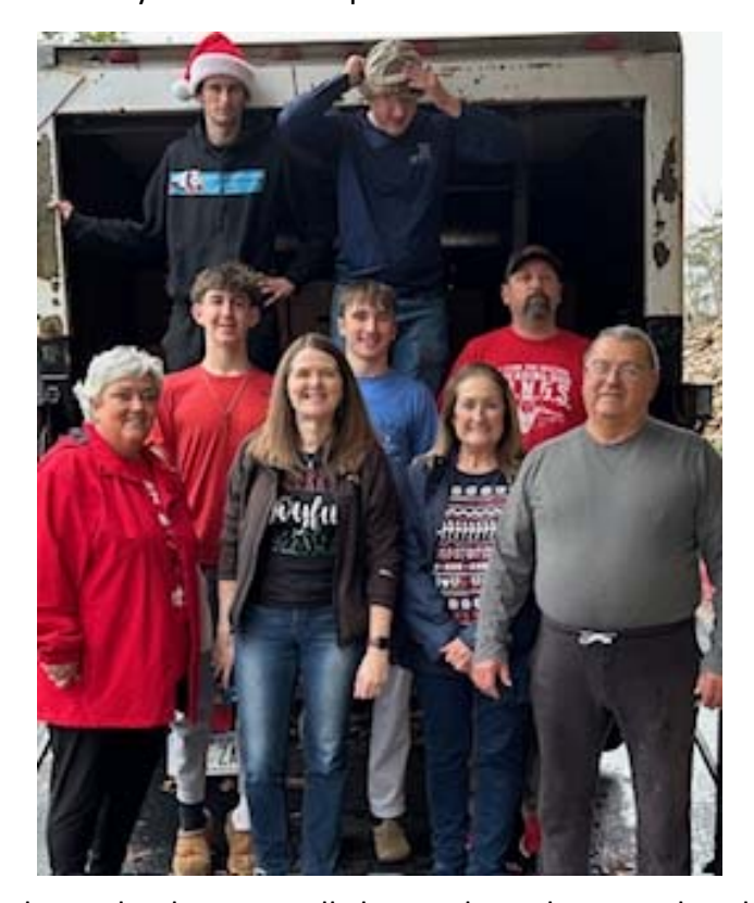
A huge thank you to all those who volunteered and helped out!

A truck full of food and presents were loaded by Mountain Pine students December 17th, made possible by Sacred Heart parishioners!!