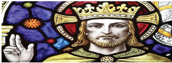
Our Lord Jesus Christ, King of the Universe